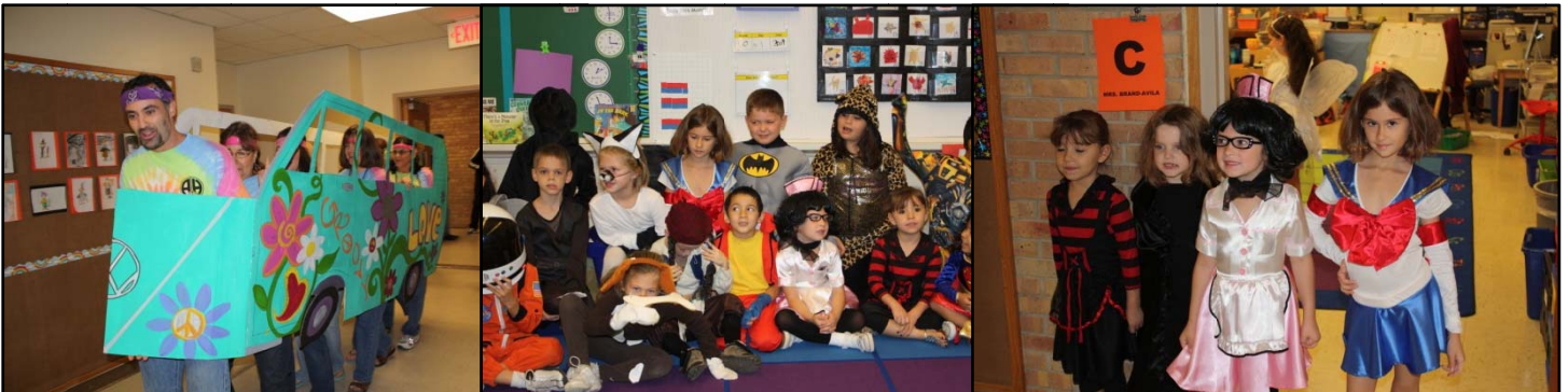
Staff and students alike participate in the annual parade.

Goblins and ghouls looked fabulous for the Woodridge school-wide parade. Even our principal and office staff got into the spirit showing off their groovy bus as they led the parade. The festivities began as the intercom played "The Monster Mash." Students grades 1 through 5 paraded down the halls displaying their creative costumes. The festivities continued with a rock-n-roll sock hop in the gym. The day was filled with pumpkin activities and fall festival parties.